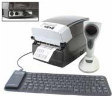
C Series-- A perfect standalone application