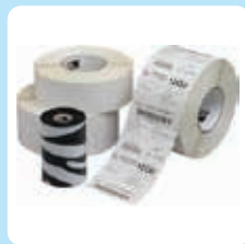
Consumables (labels, ribbons, PVC cards)