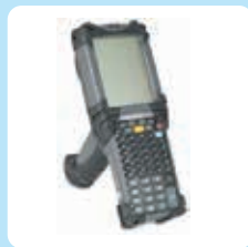
Data terminals & PDA