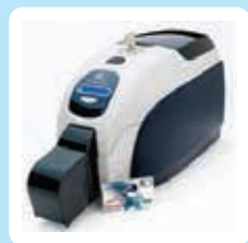
PVC card printers