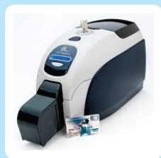
PVC card printers