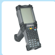
Data terminals & PDA