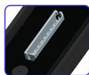
Quick Fitting and Wiring