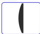
Stylish ID Design Suitability