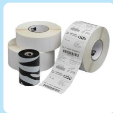
Consumables (labels, ribbons, PVC cards)