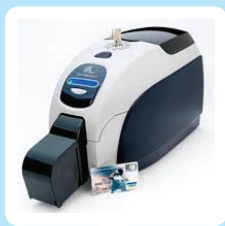
PVC card printers