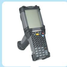
Data terminals & PDA