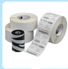
Consumables (labels, ribbons, PVC cards)